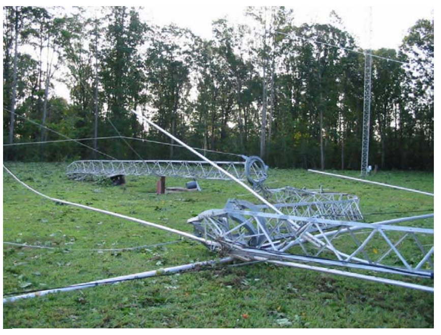
... and after Isabel