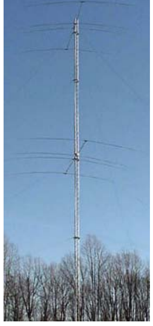
K4JA's 40M tower before...