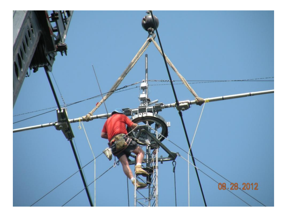
W4JAM's "good side"...