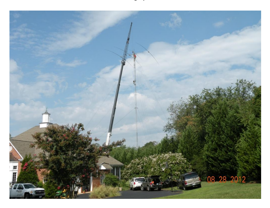
W4JAM up in the air as the MonstR comes down on August 28.

Here are some pictures from the KC4D antenna repair project. The top tower section was twisted when a tree hit one set of guys. So the MonstR etc. had to come down.