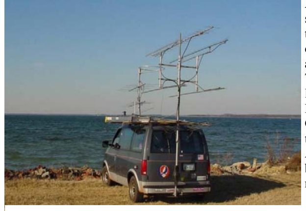
W3IY/R Intergalactic Rover Jitney, at the beach

Given that the form of the June contest likely will change for 2005 [see www.arrl.org/news/features/2004/02/26/2/ for details on the proposed changes to the VHF and above contests], it is hard for me to suggest that you rush right out and put a lot of money into outfitting a Rover Mobile through 47 GHz. But if you already own one of the many varieties of "DC-to-Daylight" radios, such as the Icom IC-706 Mk IIG, you have what it takes to provide contacts on three of the four "low" bands 50, 144 and 432 MHz. And for not much more than the cost of a dual-band FM radio you can add a 25-Watt output transverter for 222 MHz. The only hardware elements [no pun intended] remaining to complete the Rover station are antennas and a simple switch box to accommodate putting the 222 MHz transverter in line when the radio is performing IF duties.