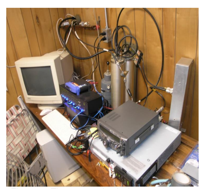
Figure 1 - The remote shack circa 2005

In 2002, while still living in Maryland, my wife and I purchased some raw land on a ridge line in Virginia after a multi-year search looking for just the right property for a remote ham radio site. Over the course of the next year and a half, AC power was brought in, a tower and shack were installed, and