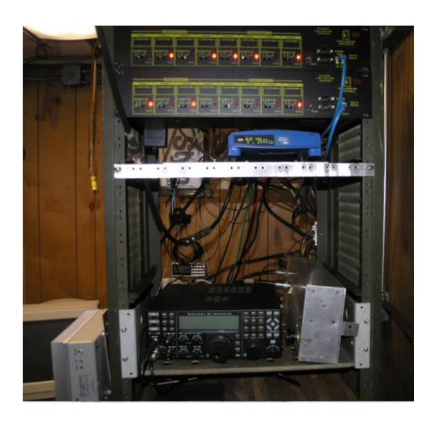
Figure 2 - The remote shack circa 2011