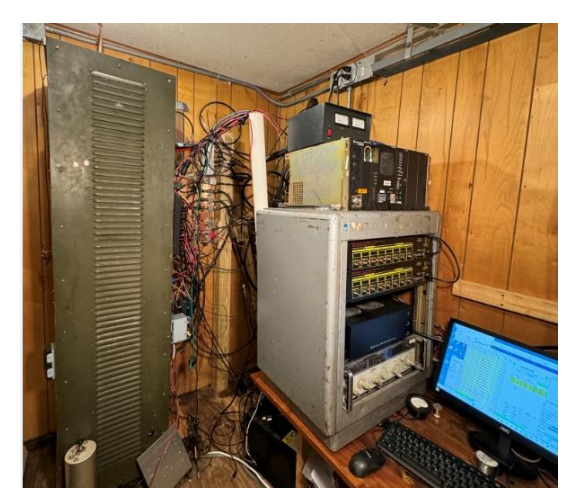
Figure 3 - The remote shack circa 2024

Alongside the grounding and bonding plan there needs to be a wiring plan. In particular, digital wiring such as USB or Ethernet cables should be physically routed away from RF cables as much as practical. Ethernet cables should be shielded, and the mating jacks must also be shielded. This will reduce the leakage of spurious signals into sensitive RF circuits.