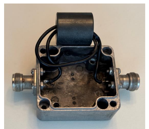
Figure 4 - A Simple Ferrite Test Set