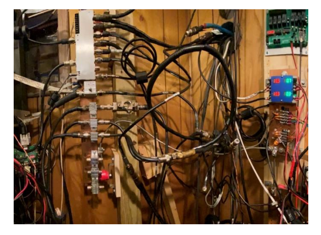
Figure 6 - after the cleanup RF cables to the left, control cables on right