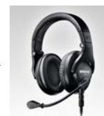
Shure BRH440M Broadcast Headset