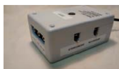
The RF Connection's Mike-Link

Mic/PTT cable RX Audio: L/R cable From Footswitch